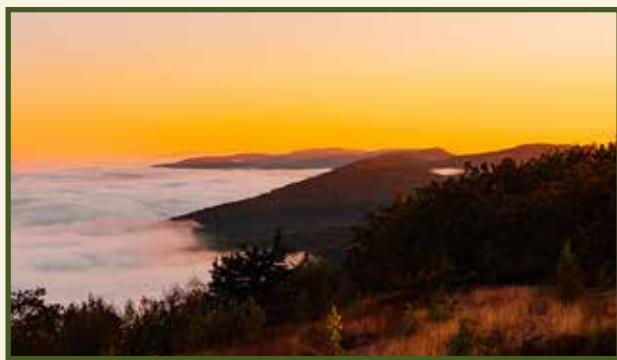
Sunrise over the Kittatinny Ridge.

Dunnfield Creek Natural Area - (1,085 acres) Dunnfield Creek Natural Area surrounds the clear, rock-strewn creek that falls more than 1,000 feet from the Kittatinny ridge to the Delaware River. Lined with hemlock, maple and birch trees, Dunnfield is also the habitat of native brook trout. Dunnfield Creek Trail departs from the Appalachian Trail above the river, follows the creek for two-thirds of its